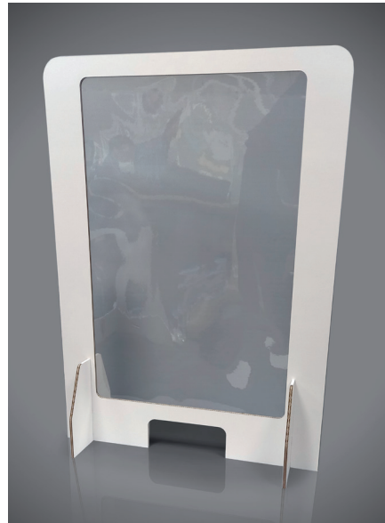
Cardboard sneeze screen Ref: ECS0412

Our Cardboard and RPET (clear plastic) sneeze screens and desk dividers are a more cost-effective version of similar perspex (acrylic) items in the market – they do the same job of helping to stop the spread of viruses like Covid-19 (Coronavirus), but are generally less expensive.